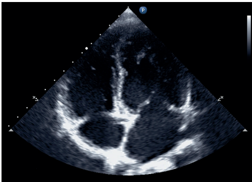
An echo image of the heart.

Echo (echocardiogram) – this is a type of ultrasound scan, which uses sound waves to create echoes when they hit different parts of the body. These echoes are translated into 2- and 3- dimensional images. This test looks at the structure of the heart, and are used to see if the heart is enlarged or if there is any thickening of the heart muscle. The images are moving, so can also look at how the heart is working. A Doppler echo looks at the speed and flow of blood through the heart, which also helps to check how the heart is working.